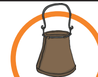
leather water bucket