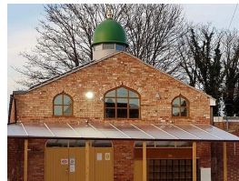
Sleaford Mosque and Islamic Centre

Many places of worship have special rules for