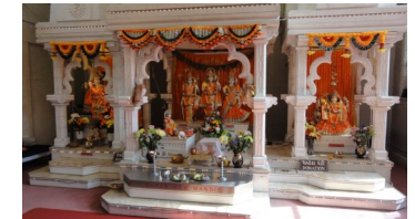
Bharat Hindu Samaj in Peterborough